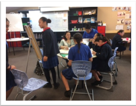
Modern spaces and modern teaching and learning practice

Changing physical aspects of a classroom can help to create a more ideal learning space for students. At LIS we are on a journey of changes to our learning spaces as well as changes in our teaching practice so that: